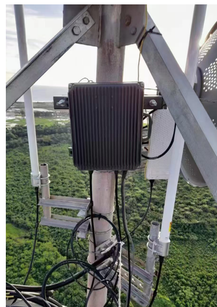
Application scenarios and Installation display