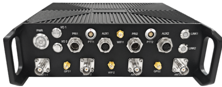
Dual-band Operation Simultaneously