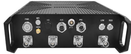
Four-band Selection Operate