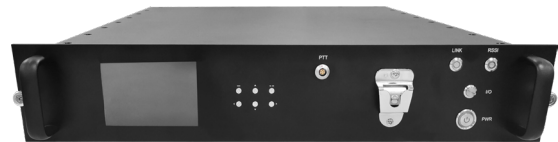
19" 2U Standard Rack With Display