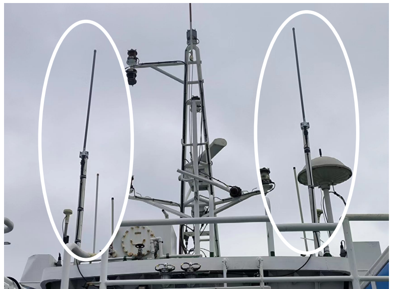
Application scenarios and Installation display