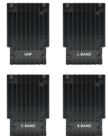
2Watts×2/4Watts×2/5Watts×2 ULSC Modular Amplifier