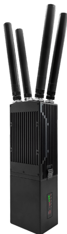
Dual-band Operation Simultaneously/ ULSC Four-band Selection Operate