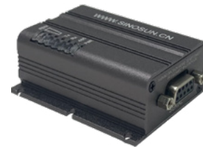
SDR400 Enclosed 46x66x25mm, 120g (2W, 232/485, 9-30V)

SDR400 series of high-speed frequency hopping digital radio (module) with long-range, high-speed reliable, low latency and secure data communication advantages. Supports full duplex serial communication and diagnostic communication. SDR400 series of high-speed frequency hopping digital radio (module) has a very high noise suppression, jamming exclusion and flexible frequency synthesis, digital modulation and matched filter detection technology.